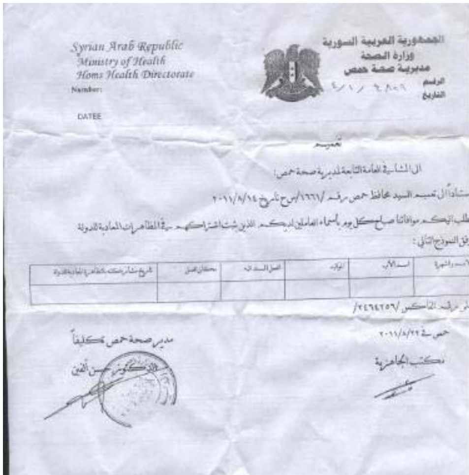
A circular issued by the Health Directorate in Homs on 22 August instructing hospitals to report on health workers taking part in protests. By doing so, the Health Directorate is putting health professionals and hospital employees taking part or suspected of taking part in such protests at risk of arrest, detention and torture.