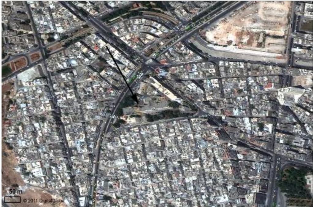
At the National Hospital in Homs, a boy, aged 15, was beaten up by a nurse as he waited to be treated in the emergency room. (Lat 34.739761 Long 36.710536).

animals... Female nurses would come to the room at different times just to poke us with needles. I was poked by at least four nurses on around five different occasions to my face, feet and abdomen.