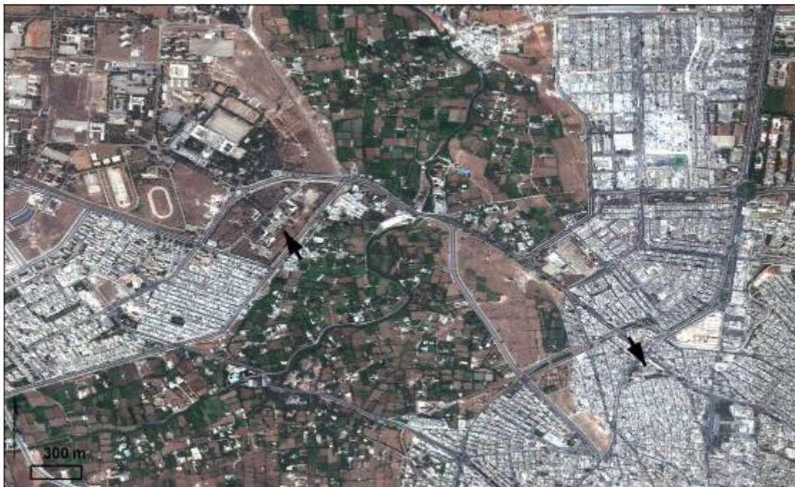
Homs: wounded people have no safe place to go. (Lat 34.711561 Long 36.707211).

In Tell Kalakh, a western town that falls under the governorate of Homs, residents opposed to