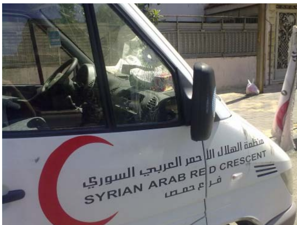
The Syrian Arab Red Crescent ambulance that was hit by at least 12 bullets on 7 September 2011.

"After the battery was charged, he spoke again with his commanders, and returned. He gave us back our cell phones and allowed us to leave. We returned to our office after around an hour."